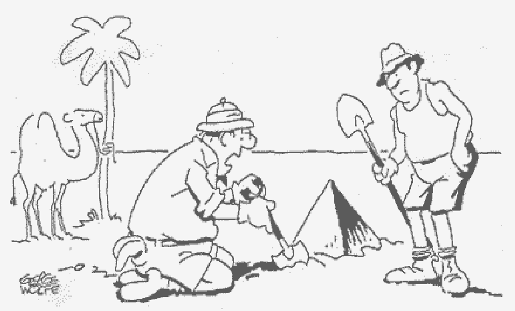
'If it's what I think it is, we've got some work ahead of us.'